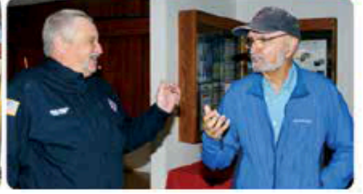
Boulder Mountain Handmade Market, Nov. 2024