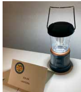
Camping lantern with multiple power supplies. (Duracell 2000 lumens #1654528, $28)