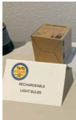
Rechargeable Light Bulbs, up to 24 hours when fully charged. ($17 for a 4-pack)