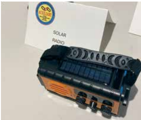
Emergency Radio with NOAA weather, hand crank AM/FM survival radio with flashlight, reading lamp and SOS siren. (product: QAUYYW 74000mWh, $35)