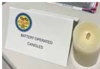
Power banks, battery operated candles, outdoor solar luminaria